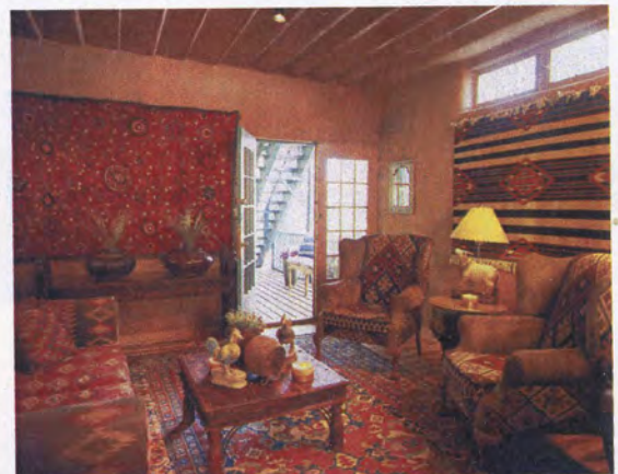
Lavishly furnished apartments at Inn of the Five Graces.

The latest Santa Fe luxury arrival, the Inn of the Five Graces , is a 22-suite boutique hotel on quiet East De Vargas Street. Recently lauded in Travel & Leisure , the inn provides unique apartments that are lavishly furnished from floor to ceiling with New Mexican and Central Asian rugs, furniture, linens, and accessories. Appropriately, the inn is named for a Tibetan Buddhist ritual of giving one's lama five gifts before taking a trip and receiving five blessings, or graces, in return. Outside, intimate courtyards feature benches, fountains, and well-groomed flora that wend their way between the inn's flagstones and adobe cottages. General manager Niall Reid hails from Britain and gladly provides complimentary walking tours followed by wine on the terrace, along with his fetching accent, of course. From $295/night. 150 E. De Vargas Street, 505/955-0549. —CANDACE WALSH >