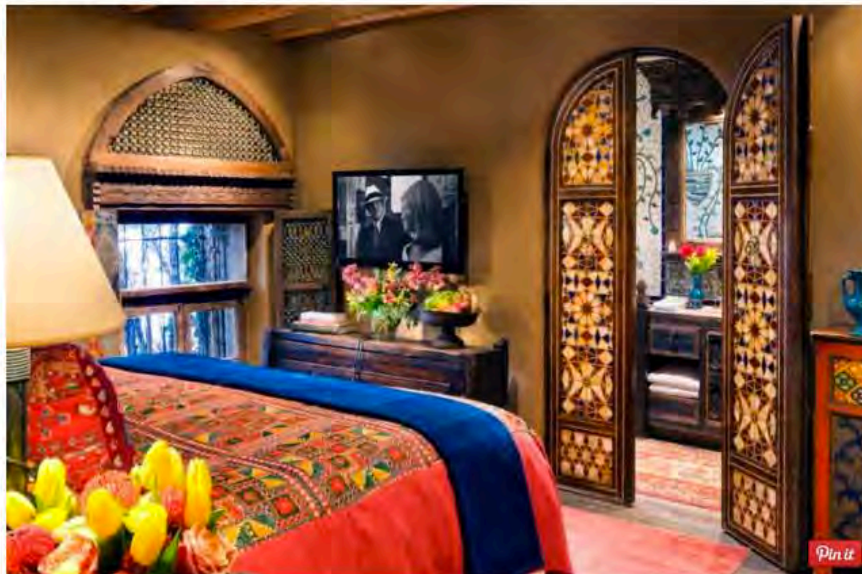
Bedroom of The Inn of the Five Graces' Cottonwood Suite.