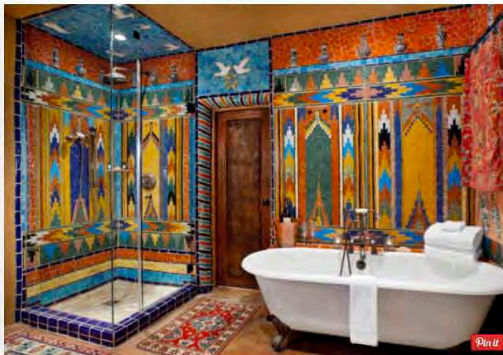
Every bathroom at The Inn of the Five Graces boasts one-of-a-kind mosaics by Sylvia Seret. Here, the Sandalwood Suite.