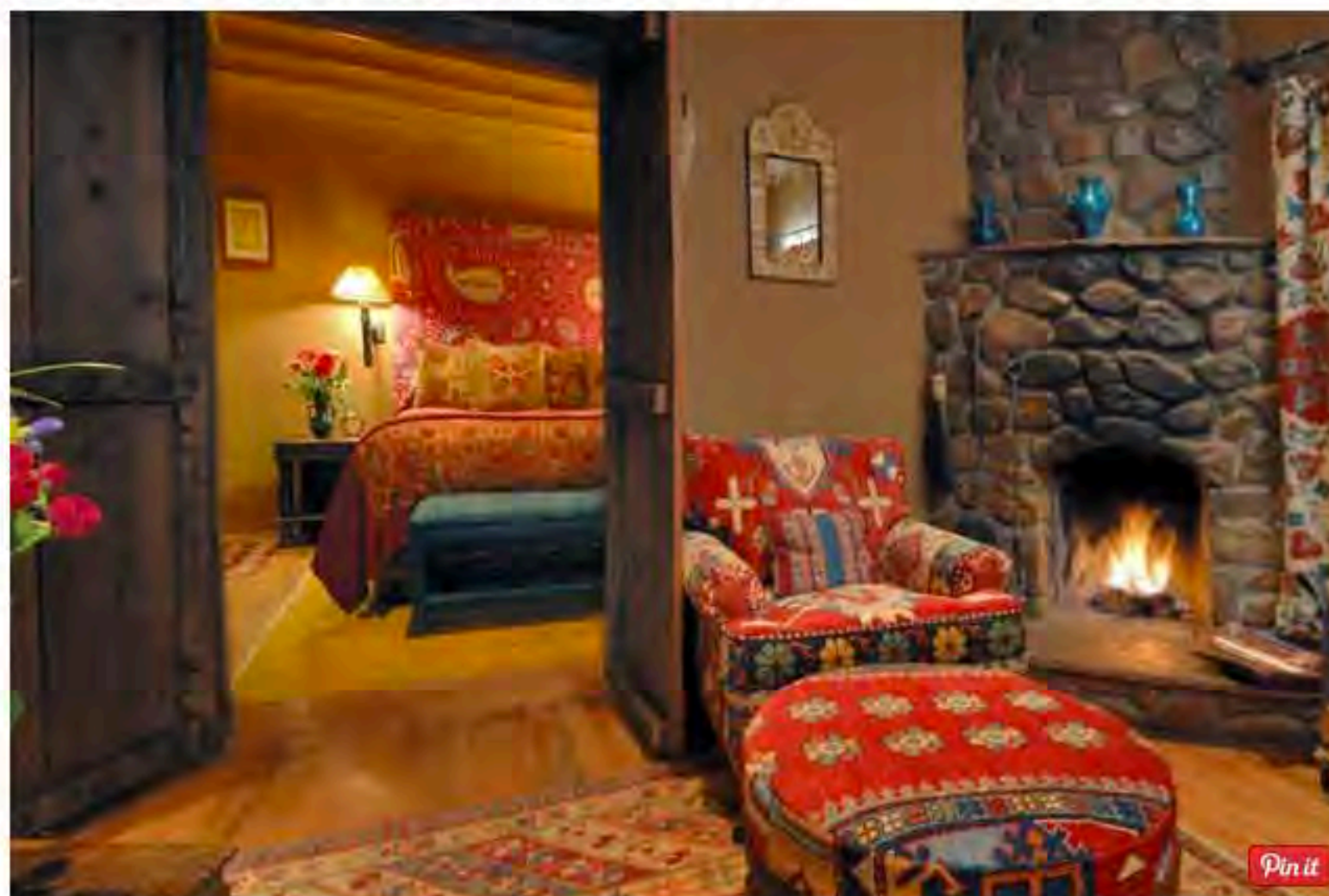
Amber, a two-bedroom suite at The Inn of the Five Graces.