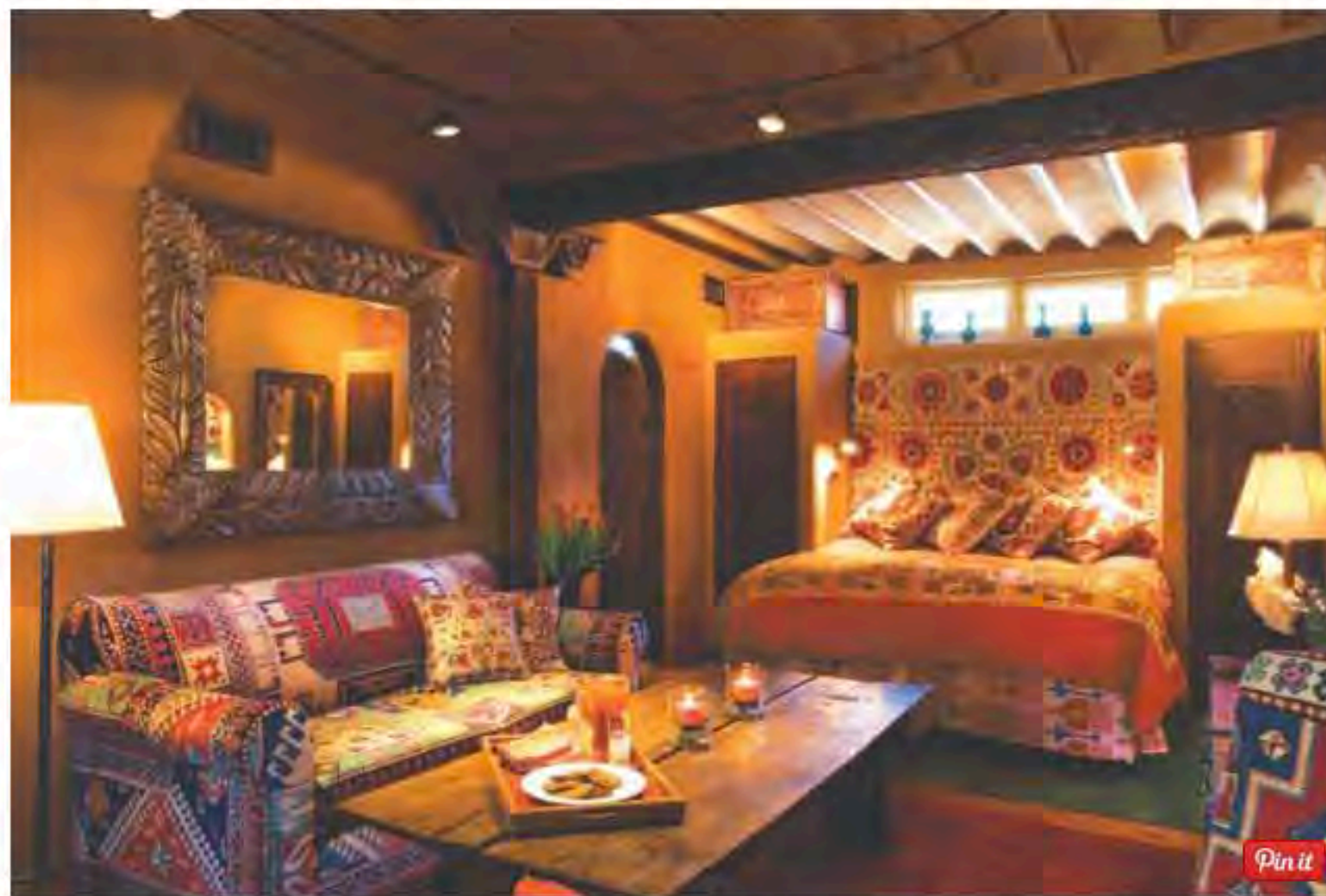
Staff at The Inn of the Five Graces likes to bring little treats to the Lavender Suite and other rooms.