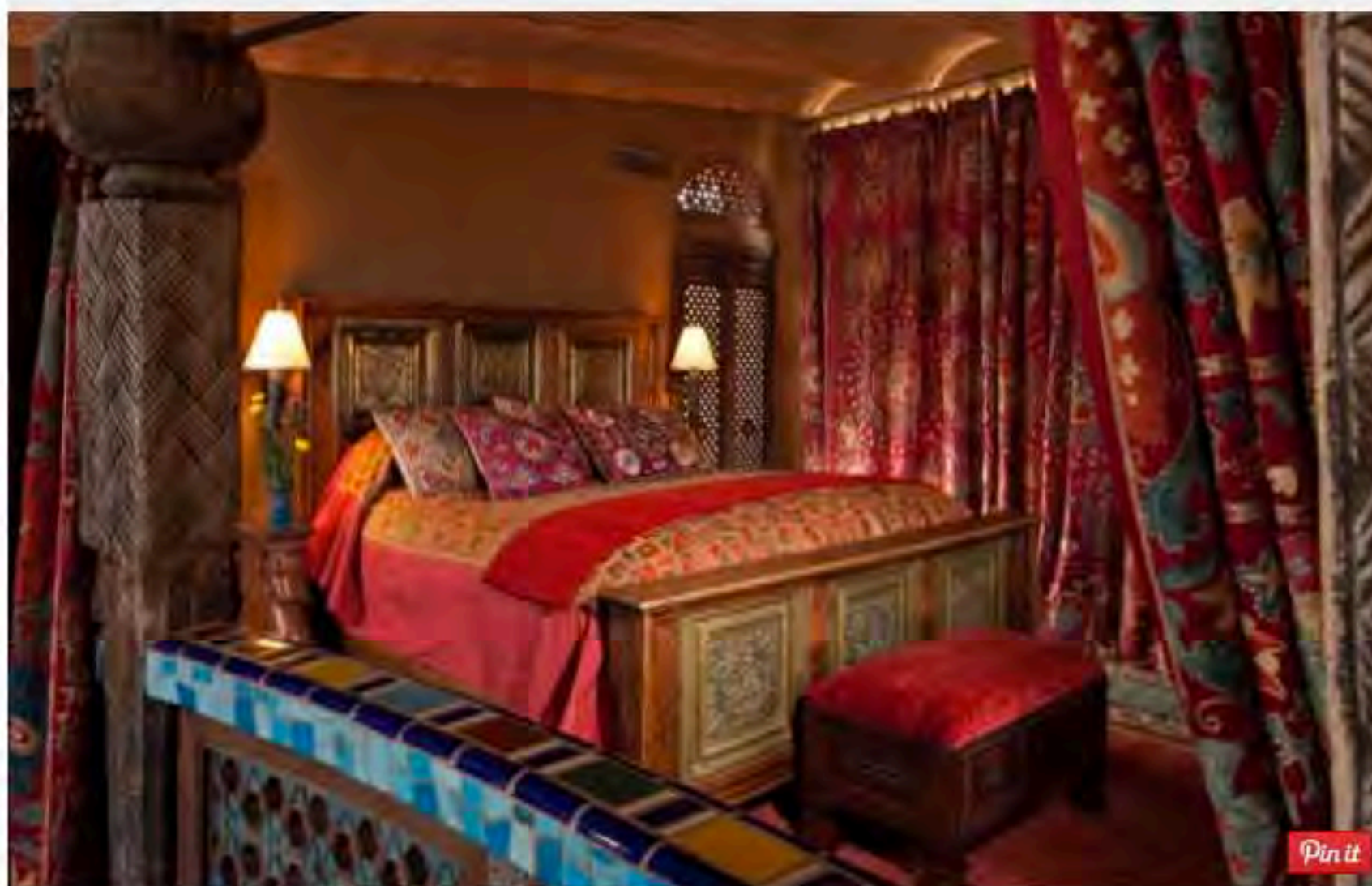
The Inn of the Five Graces seductive, two-bedroom Luminaria House suite.